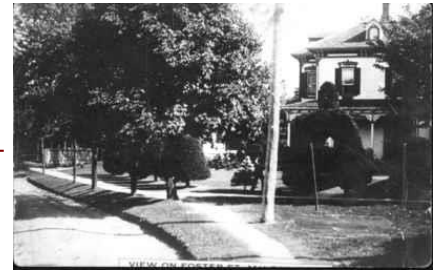
Wm. Caldwell home – 98 Charles St.

-Purchase of the walking booklets are available as another option if you wish to do a self guided tour. ($7.00 ea. or 4 for $25.00)