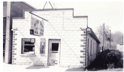
Milton Dairy – 16 Martin St.

Booking by email – info@miltonhistoricalsociety.ca confirmation will be sent Booking by phone during open hours - 905-875-4156 Wed. & Sat. mornings 9:30 am - noon