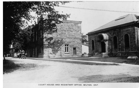
Court House & Registry Office Victoria Park Sq. (now Milton Town Hall & Hugh Foster Hall)