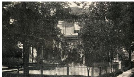
The Former Wesleyan Methodist Church Parsonage –56 James St