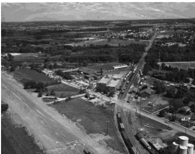
P. L. Robertson Plant – 97 Bronte St.

Drop into the Milton Historical Society office at 16 James Street during our open hours.